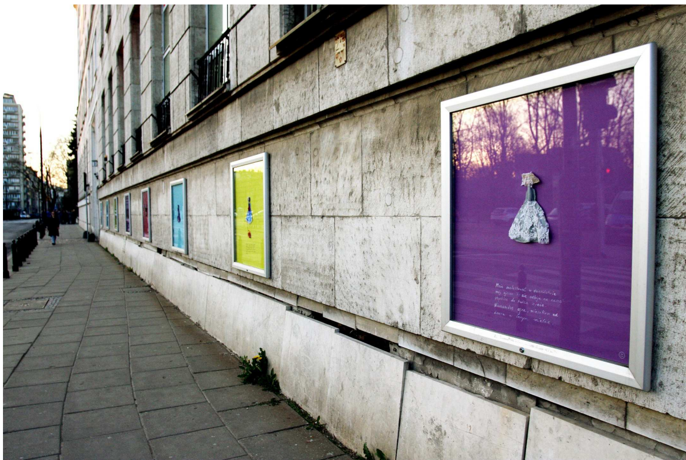
Badrooms exhibition view - Warsaw, Poland, 2015