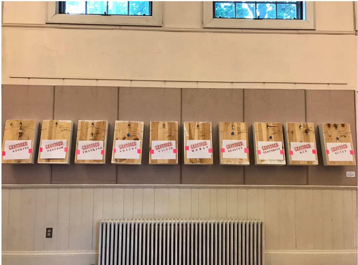
Exhibition view -Thursday afternoon: my answer to censorship