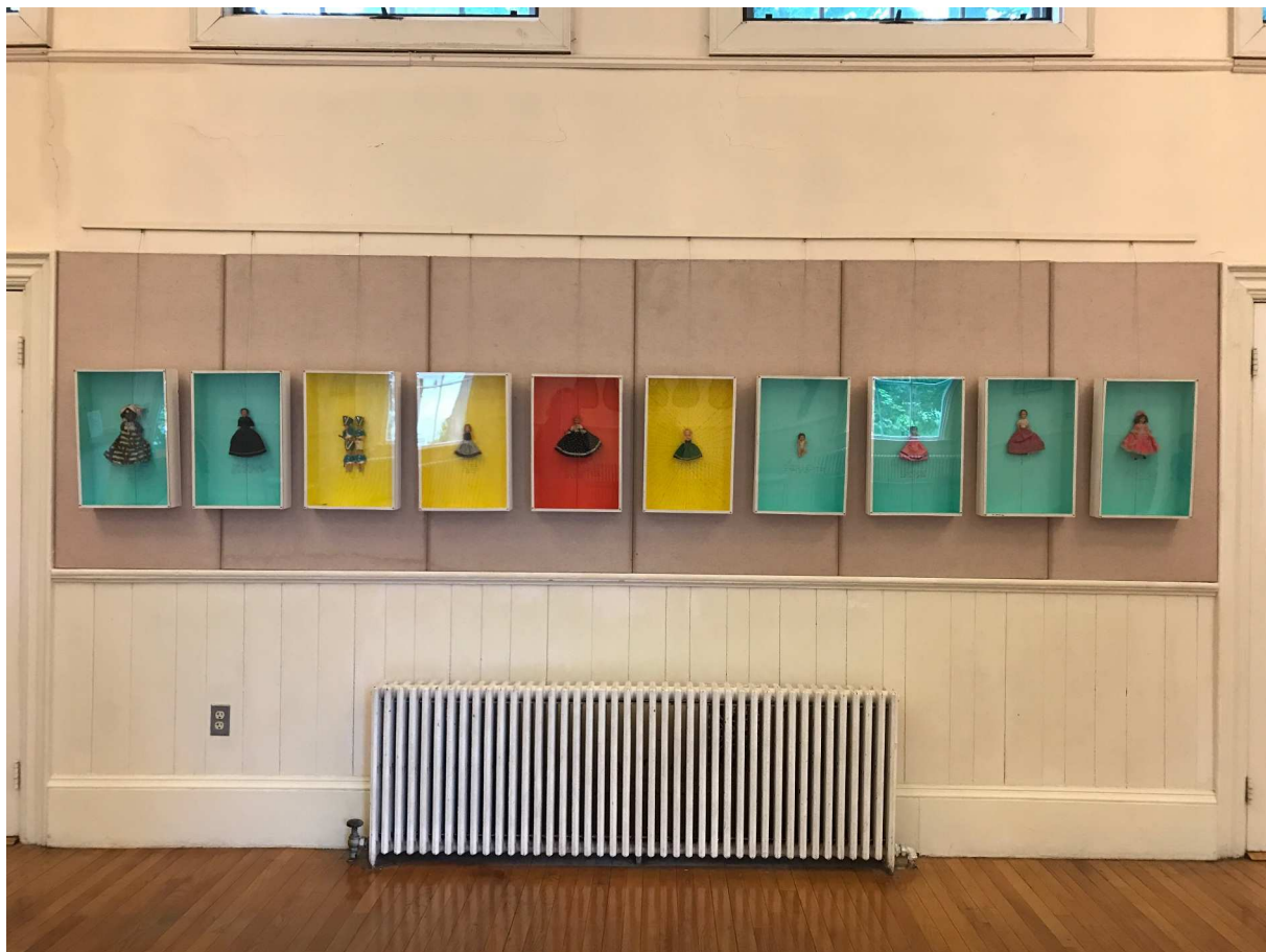
Exhibition view - Monday morning - just after the installation