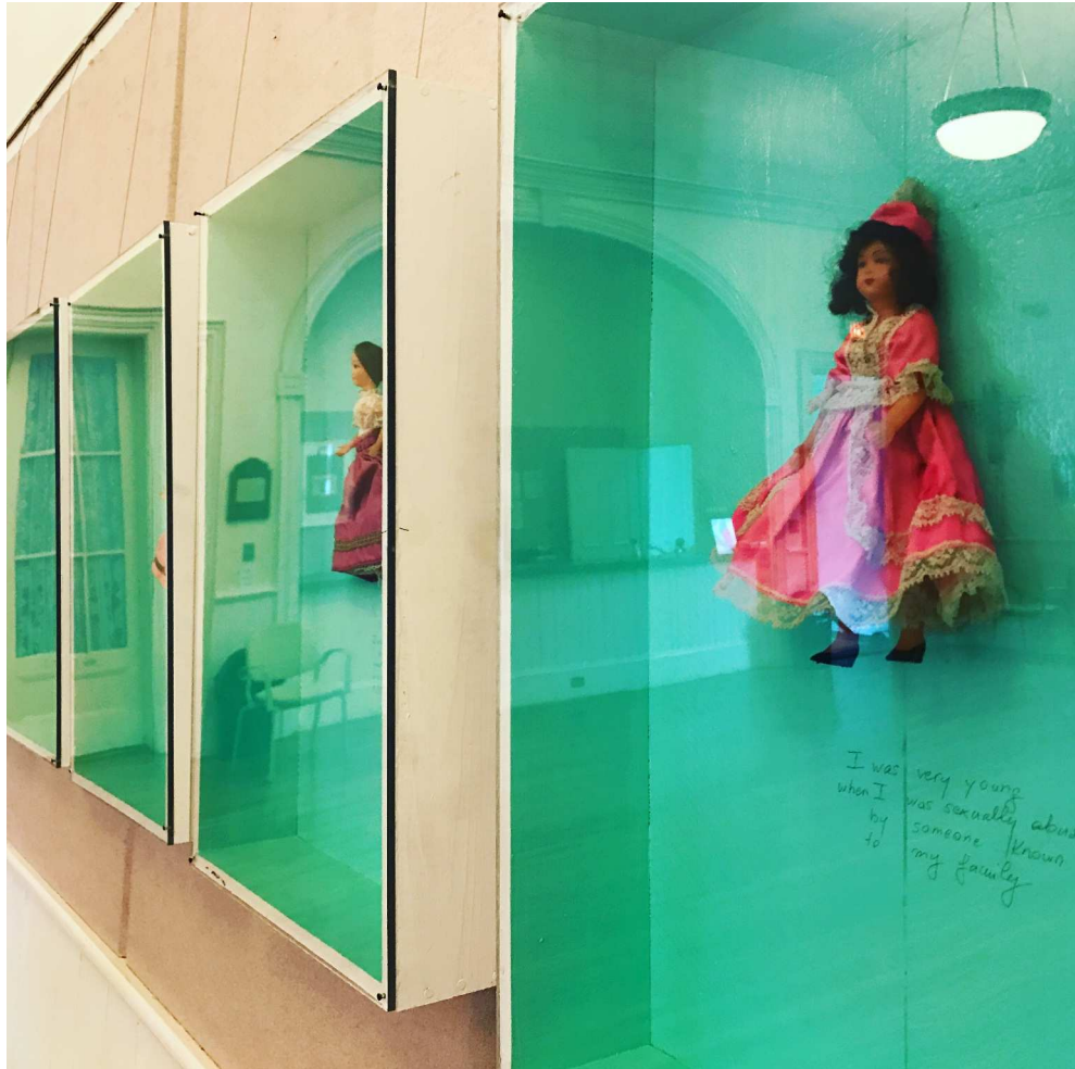
Exhibition view at the Church - June 2017