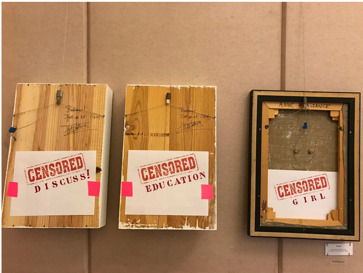
Exhibition view - Thursday afternoon: my answer to censorship