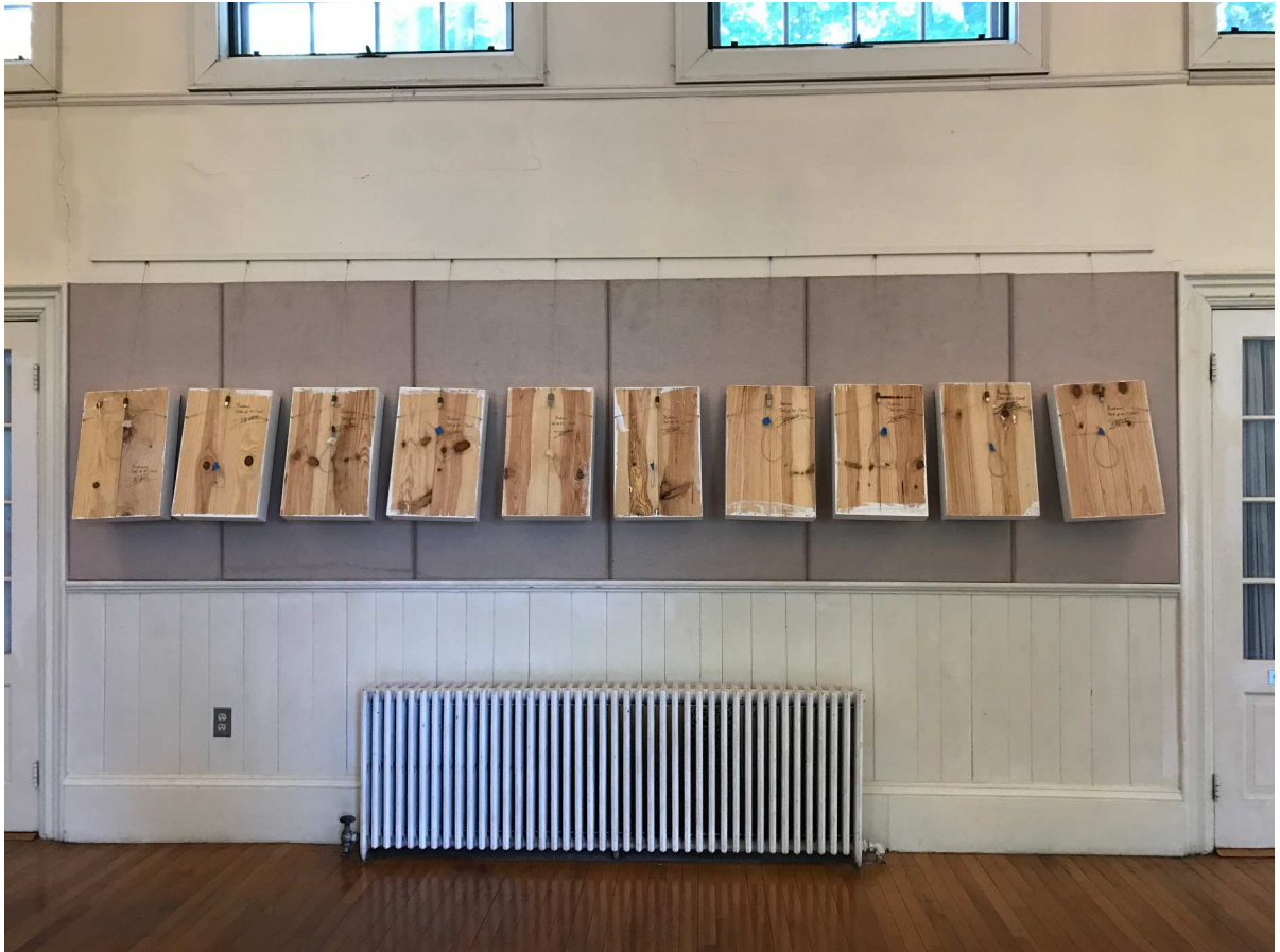
Exhibition view - Wednesday morning (no one informed me)